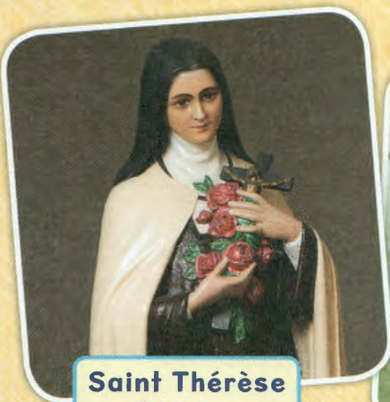
Saint Thérèse of Lisieux

She felt that God had not called her to do some of the great big, brave things that some of the Saints had done. But she knew she could still work for God through her little jobs. This is called “the little way.” She knew that God would see the love in her work.