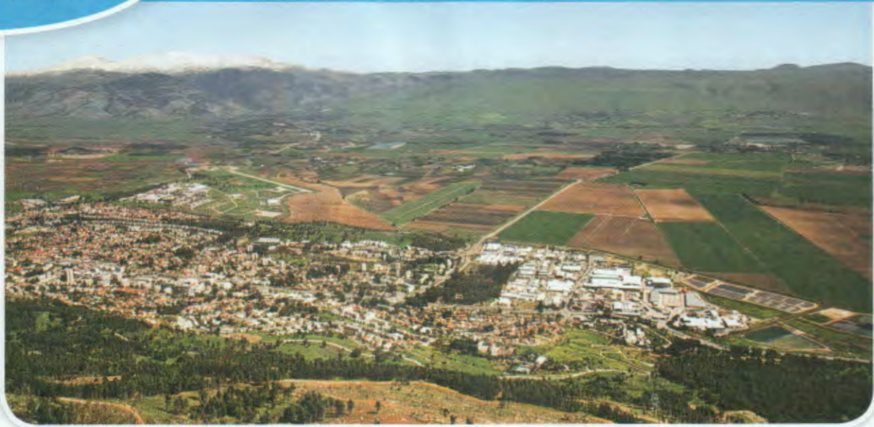
The modern-day region of Galilee, Israel, where Jesus lived and taught.