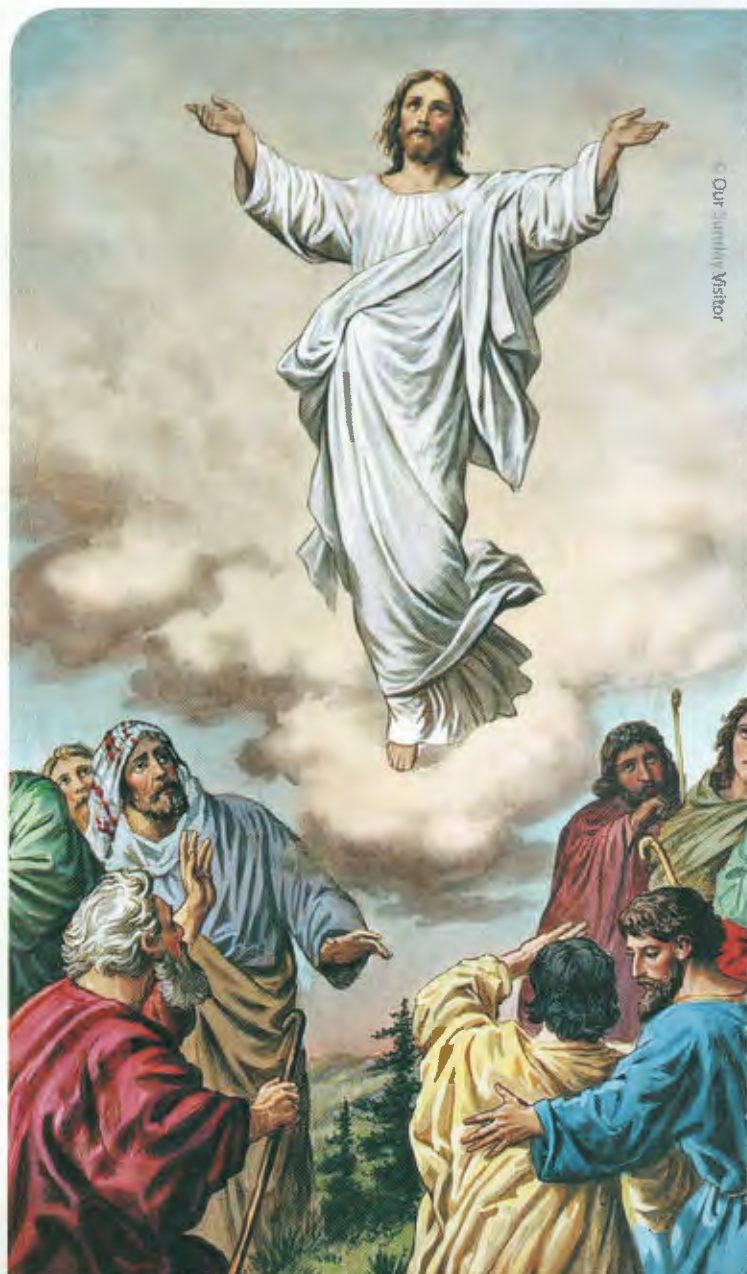
Our Holy Visitor

What do we learn from the Gospels about Jesus' sacrifice of love?