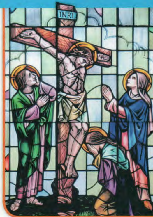
The disciples mourn and pray at the foot of the Cross.

Jesus chose to make the greatest sacrifice of all. He did something that no one else could do. Jesus gave up his life so that people could be saved from the power of sin and everlasting death. He freely gave up his life so that all people could have new life with God forever.