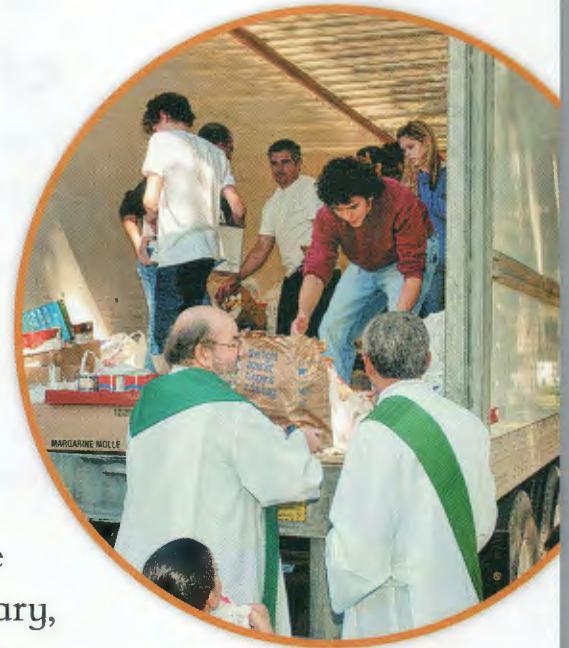
Members of parishes work together to help others in need and show love for God and others.

We help others know God when we are good examples, make right choices, and put God first. When we work together to help others in need, we show love for them and for God. Someday someone might ask you to explain why you live the way you do. When you talk about your love for God, you help others know him.