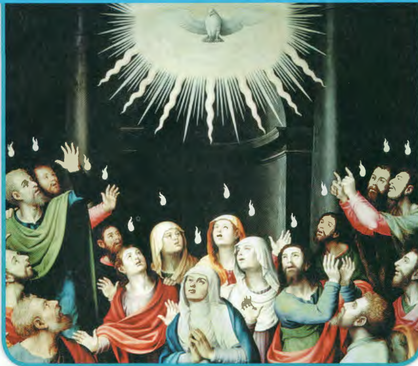
Fifty days after Jesus' Resurrection the Apostles were filled with the Holy Spirit at Pentecost.