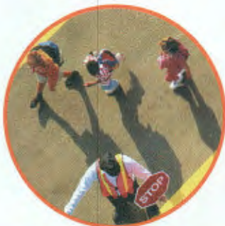
providing peace, security, and order