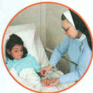
making sure that people can get the things that are necessary for life