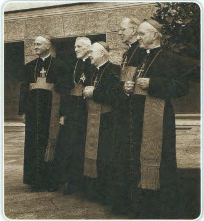
United States Cardinals Meyer, Cushing, Spellman, McIntyre, and Ritter attend the Second Vatican Council in 1962.

The Second Vatican Council will be reported worldwide by television, radio, and newspapers. The council's opening address, "Message to Humanity," begins with these words: "We take great pleasure in sending to all [people] and nations a message concerning the well being, love, and peace which were brought into the world by Christ Jesus ... and entrusted to the Church." The Church is confident that she has a message of Good News to share. The world is watching.