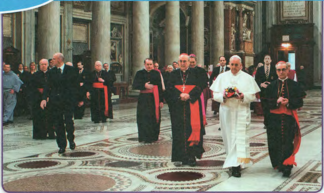
Pope Francis visits Saint Maria Maggiore Basilica in Rome with cardinals after his first appearance as the new Pope.