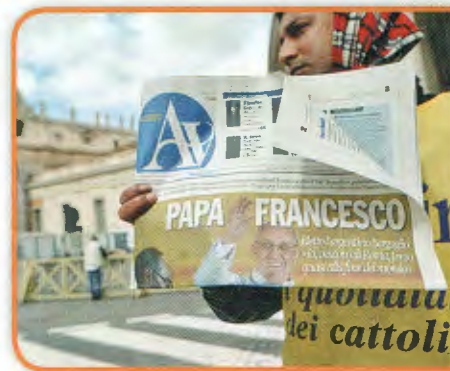
A seller in St. Peter's Square at the Vatican holds a newspaper announcing the election of Pope Francis.

The Apostles and many disciples took long journeys to spread the Word of Jesus, and they started many new Christian communities. When they moved on, many of them wrote letters, or Epistles , to the new groups. God spoke through these letters, and many of them are now part of the New Testament. The letters of Paul, Peter, James, John, and Jude tell the story of how the Apostles and others planted the seeds of Christianity.