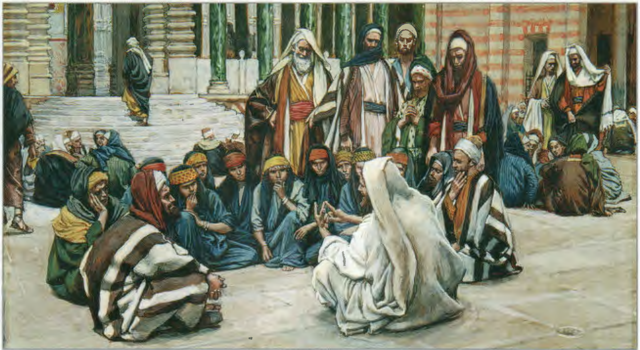
Jesus Speaking in the Treasury, James Jacques Joseph Tissot